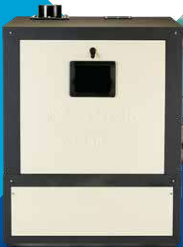
↑ ETi 400 High-Efficiency Heater