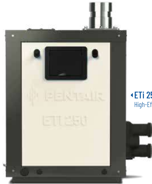
◀ ETi 250 High-Efficiency Heater