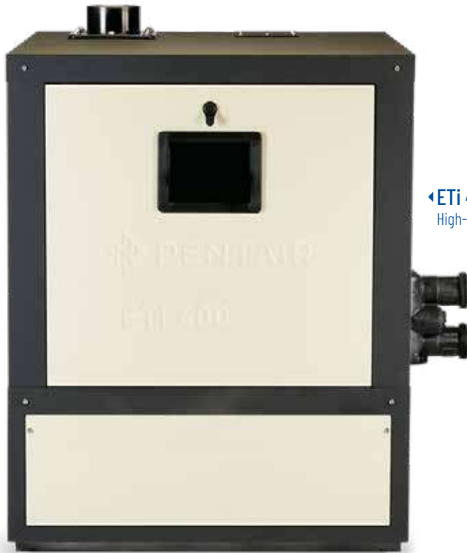
◀ ETi 400 High-Efficiency Heater