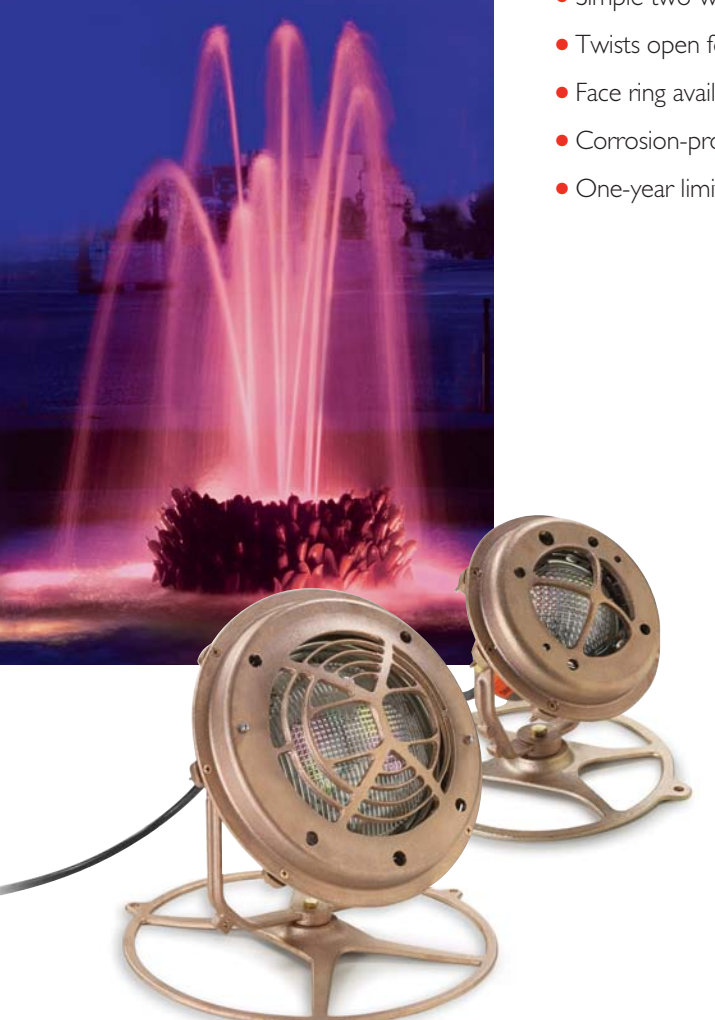
*Must use SAm light for water fountains (Part No. 600061 or 600062). Lights sold separately.