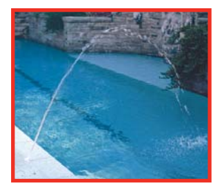
Single 5/16" stream